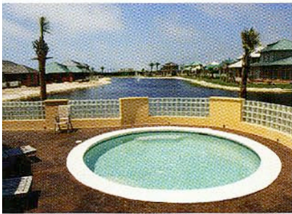
[TOP] The Beach Club Cottages are situated around a freshwater lake. [ABOVE] Homes feature space-saving plunge pools on private patios. [RIGHT] The living spaces boast high ceilings and plenty of windows.